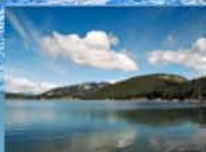
CABO SAN LUCAS