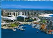
LONG BEACH, CA